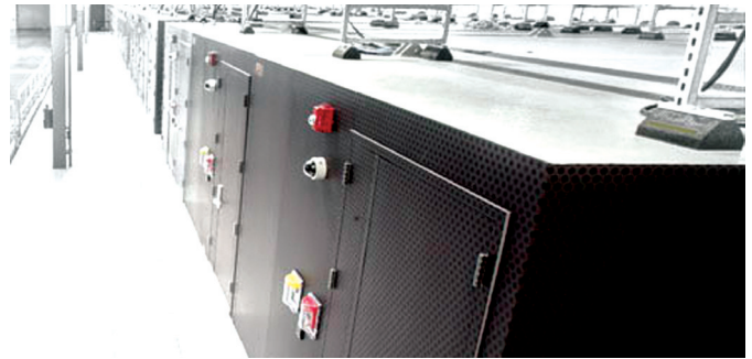
IO's Next-Generation Modular Data Center