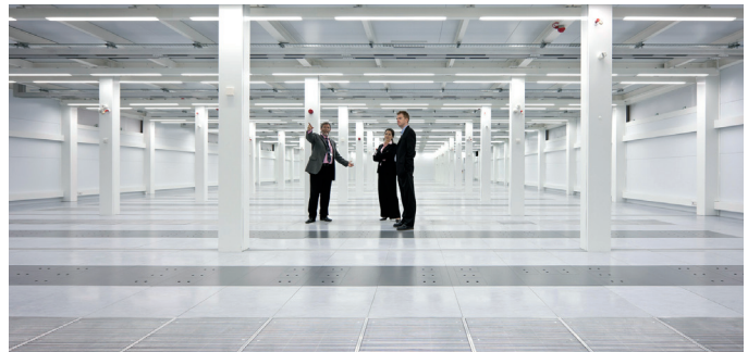
Colt Modular Data Center

Will the speed and efficiency of new data center delivery models, change the way the clients consider the purchasing process, specifically the speed of the decision-making and how they plan for future capacity?